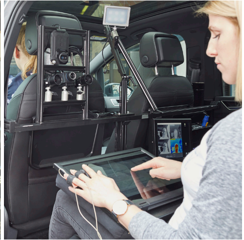
Neurotechnological Setups in Industry 4.0 and in Cars