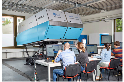
Neuroergonomic Assessments in Driving Simulators